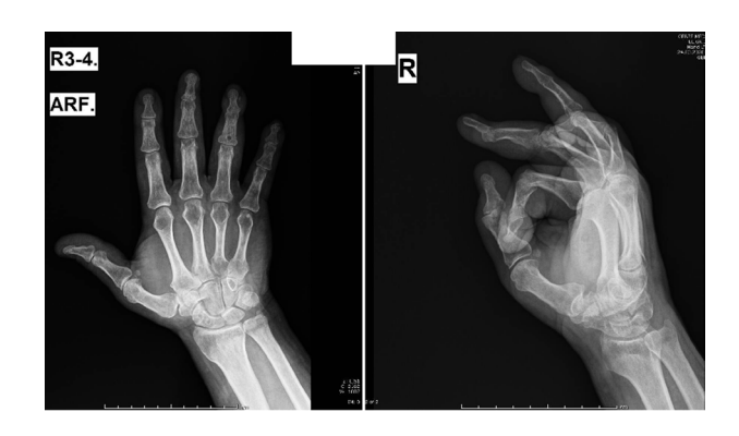
Figure 6. Six months after the olecranon bone grafting, the bony healing was complete

in nonunion in the 3rd finger, as confirmed by x-rays taken in the 6th week [Figure 3]. At 7 weeks after the first operation, an arthrodesis with an olecranon graft was performed on the 3rd distal interphalangeal joint [Figure 4]. The thickness and stability of the nail bed were suitable, so grafting was performed through the incision in the middle of the nail bed [Figure 5]. Six months after the olecranon bone grafting, the bony healing was complete [Figure 6].