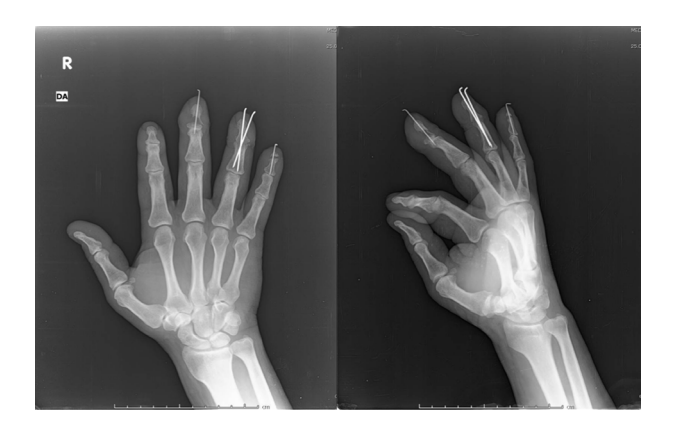
Figure 3. Segmental bone defect can be seen in the distal phalanx of the third finger